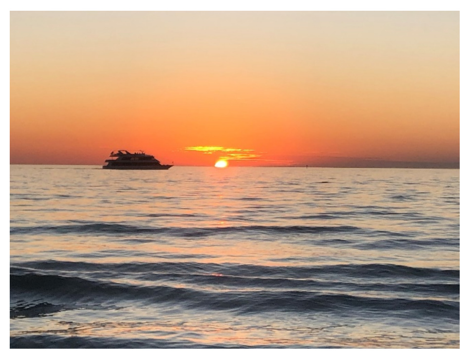
Sunset at Clearwater Beach

Clearwater beach. It was a nice, relaxing day before diving back into the long, but worthwhile workshop sessions.