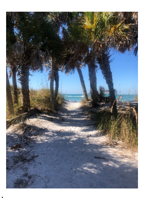
Beach path on Egmont Key Island

In the midst of the conference, and workshops networking, Lynne, Kelly and I had one unexpected day off following a course schedule shuffle - we spent the day exploring Egmont Key Island, a small uninhabited island turned into a national wildlife refuge in 1974. We spotted some dolphins during the boat ride to the island, and even had a very quick swim in their presence as the boat was about to depart. We then enjoyed a beautiful sunset at